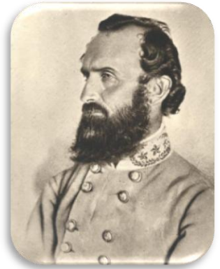
Lt. Gen. "Stonewall" Jackson