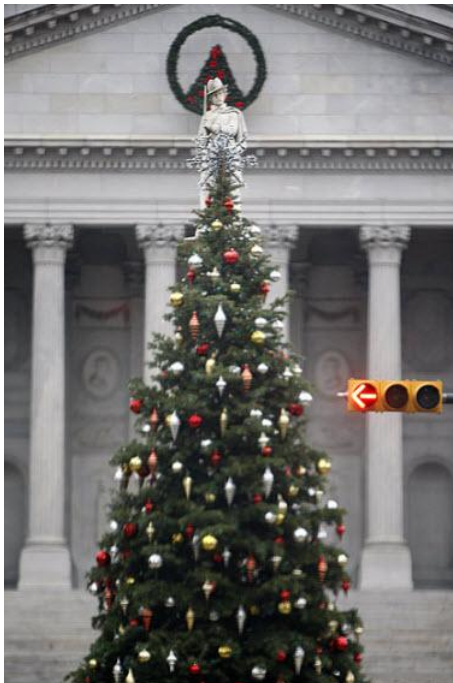
2014 South Carolina State Christmas Tree

And sweetly from the far off years comes borne the laughter faint and low, the voices of the Long Ago! My eyes are wet with tender tears.