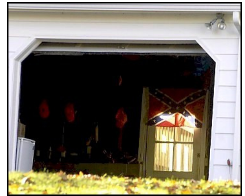
The offending photograph. You might be able to make out the flag if you try real hard...