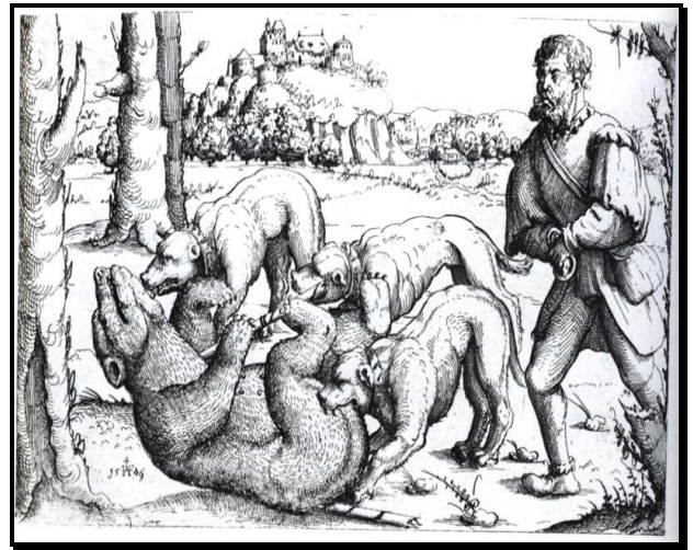
Not our General Hampton, but a very good likeness! Bear Hunt by Augustin Hirschvogel (1503-1553)

Hampton always had the help of a pack of hounds, sometimes forty in number. When he heard the dogs holding a bear at bay, he rode up and urged them to close with the animal. Then as the dogs worried the bear, Hampton ran in close, reached across the animal and stabbed it behind the shoulder on the opposite side. See BEAR HUNTER, Page 2